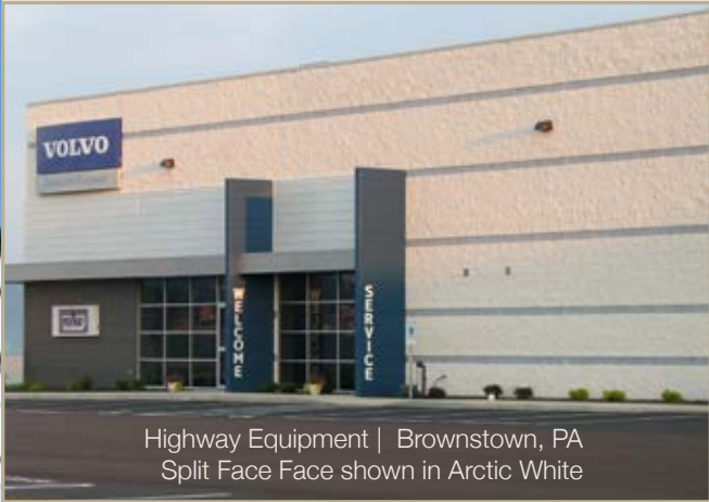
Highway Equipment | Brownstown, PA Split Face Face shown in Arctic White

SPLIT FACE masonry units are a popular architectural finish as they offer a uniquely textured face where no two units are alike. This provides aesthetic depth to building design.