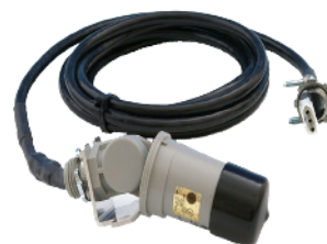
9': TS-TPHOT9 15': TS-TPHOT0

Black direct burial polyvinyl chloride (PVC) coated copper low voltage wire. Available in 12/2 or 14/2 in 250 ft. length.