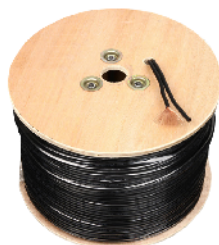
12/2: TS-122G250 14/2: TS-142G250

Input: 120VAC, 50/60Hz Output Voltage: 9V – 15V AC Includes Built-in Mechanical Timer Dimensions: 4.3"(W) x 6.7"(H) x 4.3"(D)