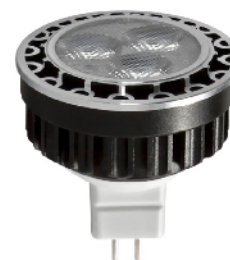
4W: TS-40MR16 5.5W: TS-60MR16

Power: 3W LED CCT: 2700K Beam: 360° Lumens: 300